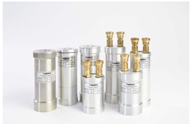
Selection of Pylon Cells

Contamination from materials such as Ra-226, Am-241, and Th-230 can occur. This is more likely to happen with soil sampling or measurements in industrial locations than in residential measurements. This type of contamination is usually associated with visible dirt or dust